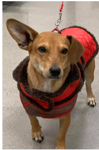
Adoptable Buddy and Ginger were all dressed up for the Meet N Greet at PetSense in Hays. How cute are they in their sweaters?