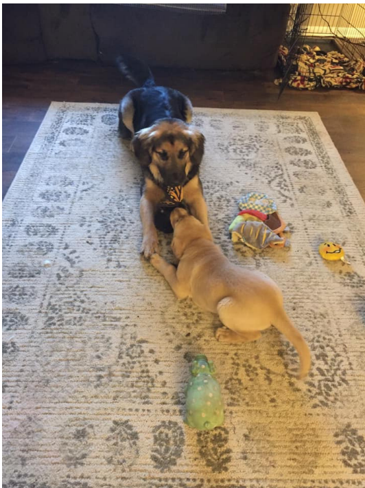
Adoptable Rosy and Frenchy play tug of war with some donated toys! Toys are so important to keep our dogs, especially the puppies, busy so they don't get into trouble.

Fosters, Volunteers, and Transporters are always needed as well!