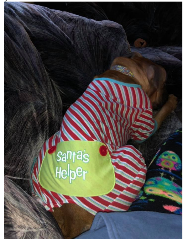
Hopefully you had a helper as good as adoptable Athena helping with all your Holiday to-do's!

We hope all of you have a wonderful 2019! If you've thought about joining us before, 2019 is the year to do it! We have a lot of exciting things being planned and would love to have you!